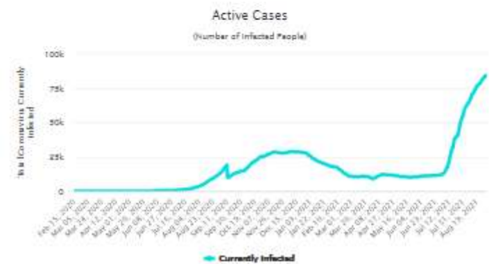
Active Cases in Libya