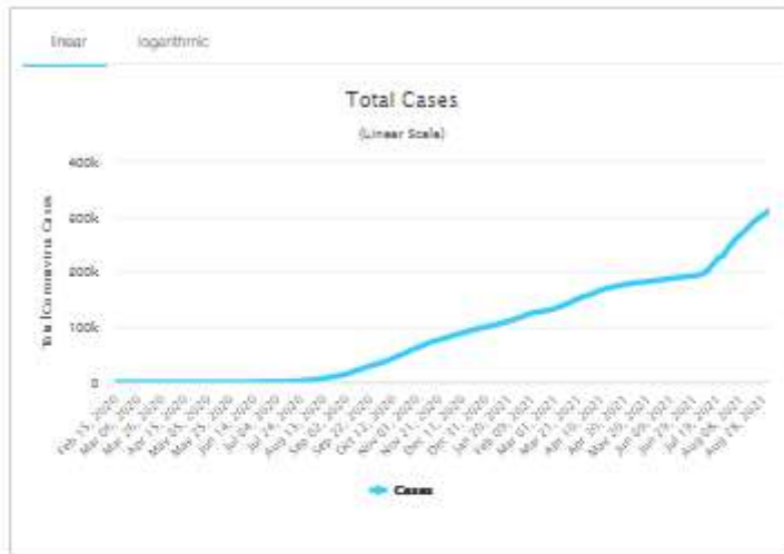
Total Coronavirus Cases in Libya