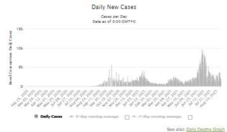
Daily New Cases in Tunisia