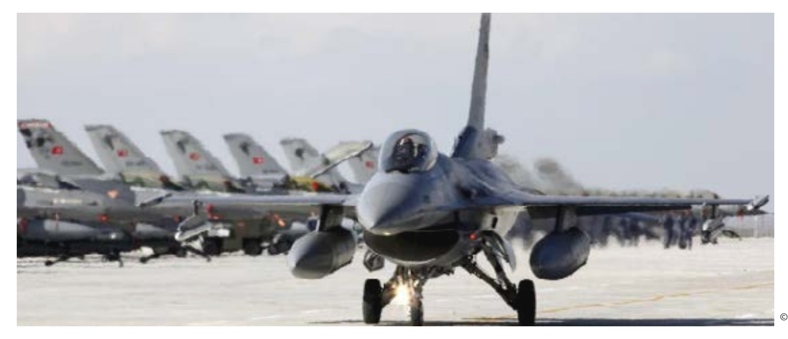
F-16 fighter jet

eastern Libya in 2016. They went on to establish the first foreign military base at Al Khadim in 2016, a sign of their military commitment to Libya, and the first foreign military base in the country's history since Qaddafi <u>expelled</u> the US military from Wheelus airbase (now Mitiga airport) in 1970. It is often believed that the UAE's foreign policy is exclusively motivated by counter terrorism. This belief posits the UAE's political and military support for Haftar and the LAAF as exclusively driven by a desire to establish a "secular" force in Libya through counterterrorism and a fear of 'Islamist dominance'. This policy has come under scrutiny for Haftar's overt anti-democratic political objectives, but also the role and rise of the LAAF's Salafi-Madkhali armed groups. These Salafi armed groups have deeply held religious views they seek to promote across Libya's society, a rigid anti-democratic outlook, and have exponentially grown in number and power as a result of the UAE's support to the LAAF as a direct contradiction of this policy.