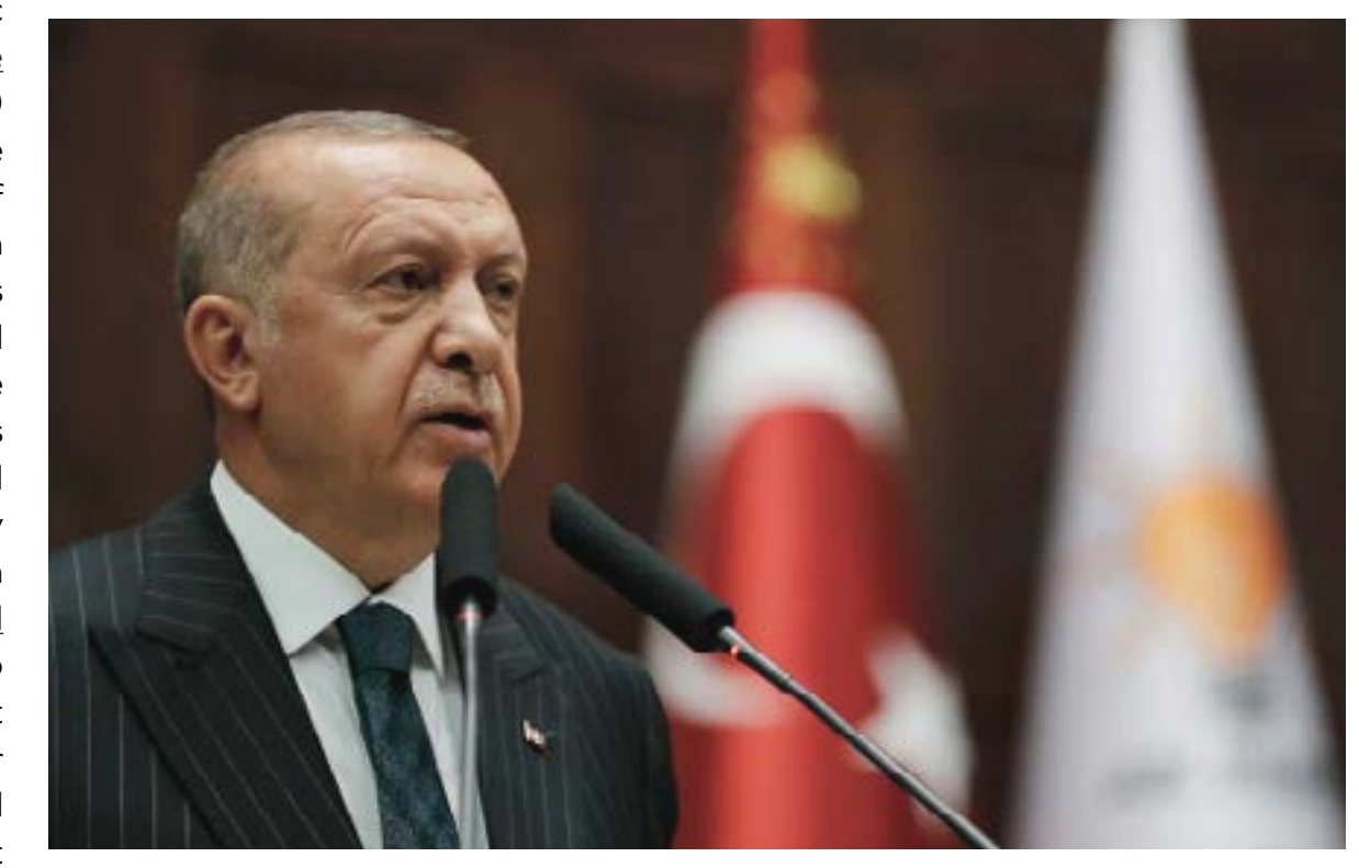
also because the party has hinted the Recep Erdoğan - AKP leader and President of Turkey

The UAE's cultivation of military rulers that mirror their ideological outlook across North Africa has directly targeted both Turkey and specifically the AKP. The UAE's cultivation of a particular brand of authoritarianism and partnership with actors and institutions that restricts political participation under the guise of counter terrorism and anti islamism, and even anti Ottomanist rhetoric has limited Turkey's ability to find suitable political partners to engage and ideologically compatible states with whom they can establish strategic relationships in Libya and the region. Libya's divided political actors and rival network of ideologically driven armed groups perfectly illustrate Turkey's options in a binary ideological landscape where the options are largely limited to military or civilian rule.