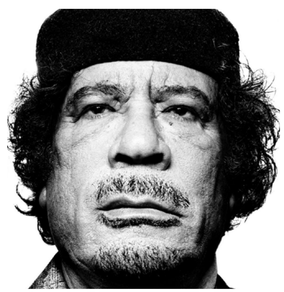
The Jamahiriya – Power and ideology under Qaddafi

revolution in 2011 fundamentally transformed the old socio-political order of the Qaddafi regime, the system to distribute and divide power and privilege in society, and the ideological character of the state. Most importantly, it established a fundamental fault line between rival networks of armed groups over the institutional structures of the state that predates the GNA and LAAF's conflict in 2019, but is central to understanding it. Qaddafi's 42 years in power are often misunderstood. On the surface, the unusual and idiosyncratic ideas outlined in the Green Book his vision for structuring the state and organising society known as the Jamahiriya are often the <u>reference point</u> to understanding Libya's political and social system over the period of his rule. However, behind the populist rhetoric and political slogans, little is understood about how Qaddafi managed power and maintained his ideological and authoritarian grip over Libyan society for so long.