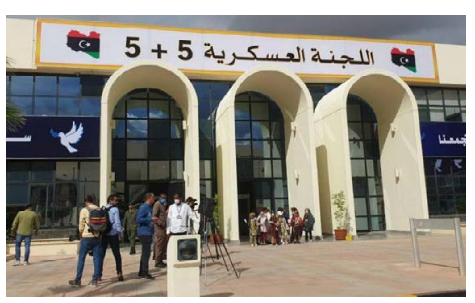
The 5+5 military commission headquarters in Sirte, Libya

However, it is the tribally inspired and religious groups, whose presence within the LAAF's structures serves an ideological and authoritarian purpose that are likely to be beyond reproach and any post-unification efforts to dismantle them as militia.