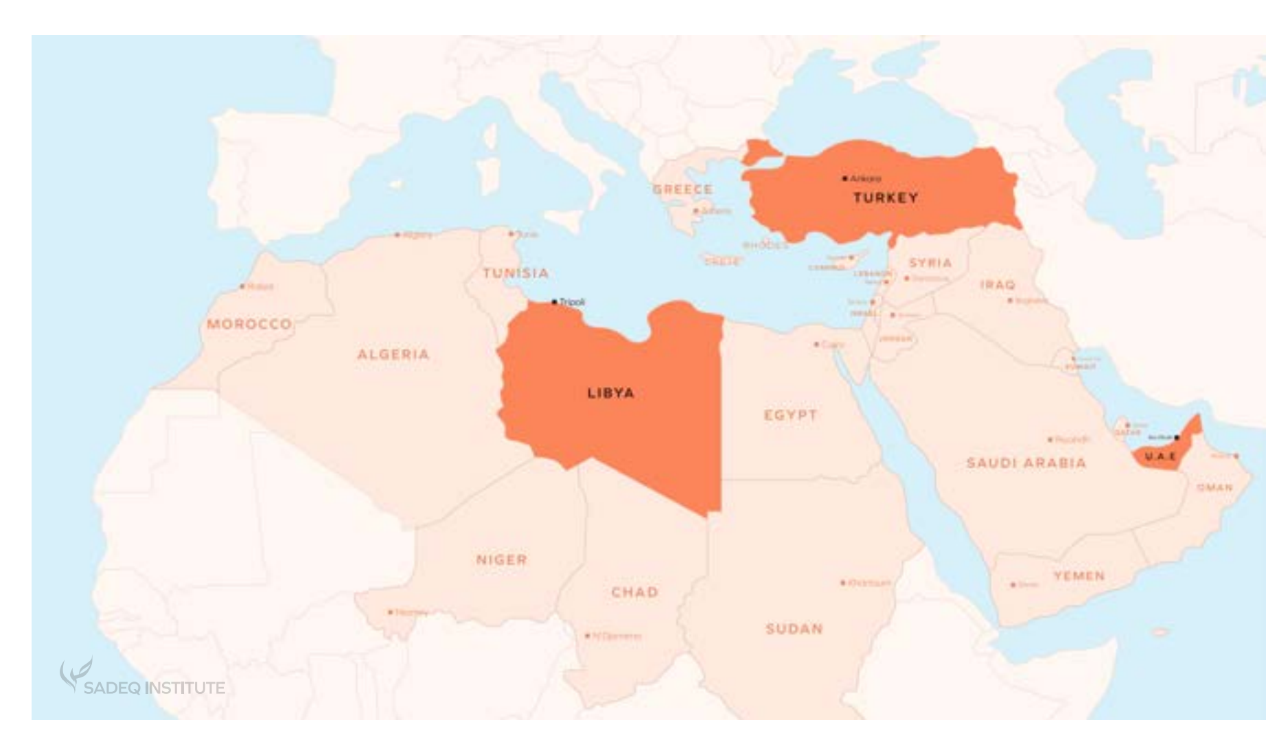
Turkey and UAE intervention within Libya

Foreign actors have been drawn to Libya for a variety of economic motives and geo-strategic reasons, but little is written about the deeper underlying ideological objectives that have drawn foreign sponsors to exclusively support either of the two rival political factions and their networks of armed groups in Libya.