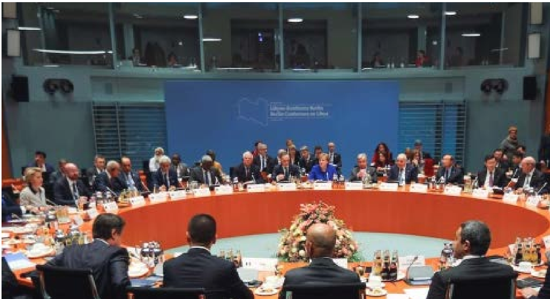
Berlin declaration in January 2020

of the LAAF, but how this very same obstacle will undoubtedly return in the near future and resume itself, how will the LAAF respond to scheduled presidential and parliamentary elections that will replace the negotiated PC and replace Aguila Saleh and the HoR? The negotiations are aimed at negotiations over the PC, and its unification talks, designated minister of their choice in a new cabinet. to civilian rule irrespective of the civilian or military chief in charge. It is also the reason why democratic change through Presidential and parliamentary elections in 2021 poses the highest risk to peace and a return to conflict in Libya along the same ideological lines as the current negotiations if the outcome of elections is unfavourable to the LAAF.