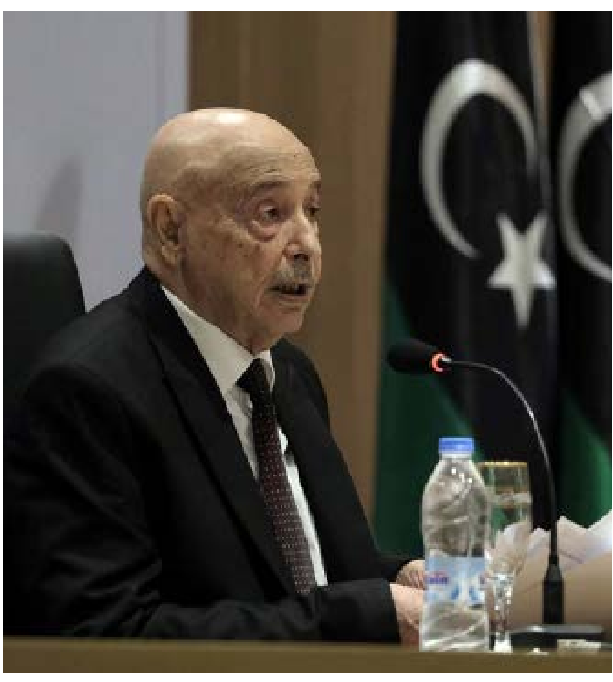
Aguila Saleh - former Supreme Commander of the Armed Forces