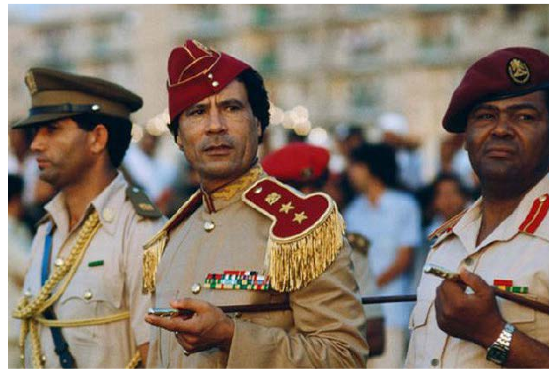
Former Libyan leader Muammar Al Qaddafi alongside former Defence minister