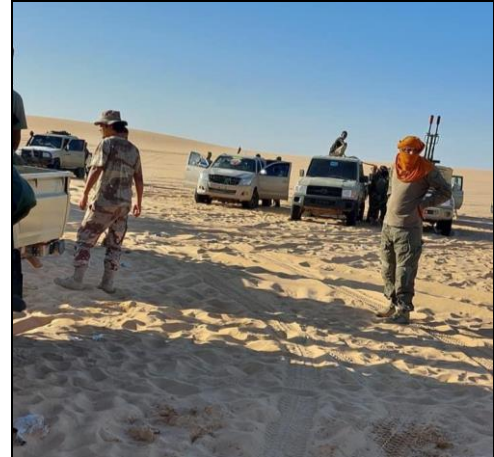
LNA armed groups combat preparations

ASSESSMENT: These confrontations will highly likely continue in those areas of Southern Libya where foreign forces have more freedom of movement.