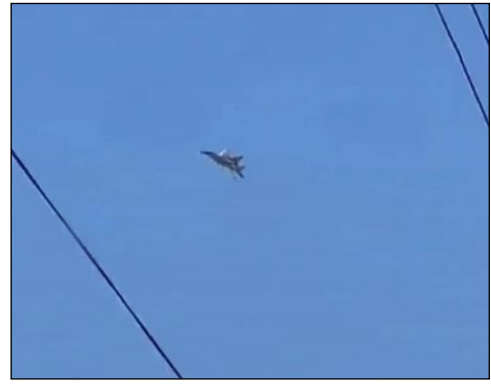
Russian MiG-29 possible present at the scene