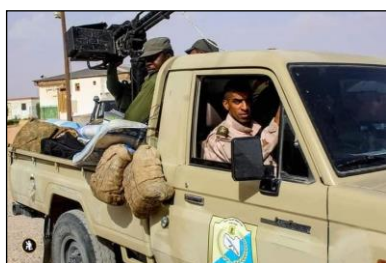
Umm al Aranib Martyrs Brigade