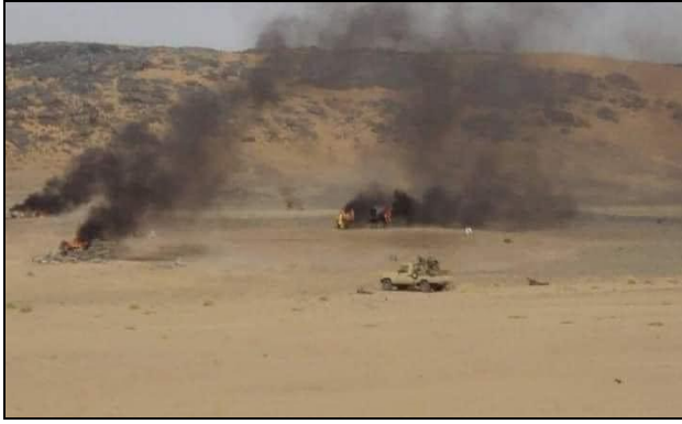
Aftermath of the clashes