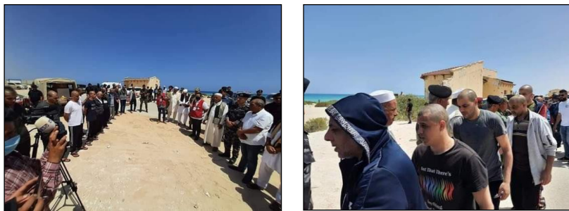
Prisoners exchange in Sirte