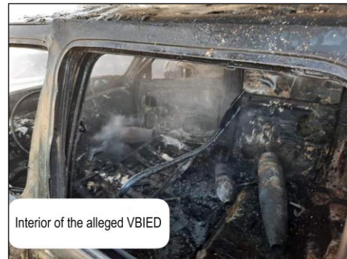
Interior of the alleged VBIED