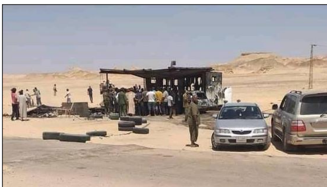
Aftermath of the reportedly SVBIED deflagration