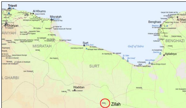
Location of the attack, in Jufra province

On 22 August, a suicide vehicle-borne IED (SVBIED) has purportedly targeted an LNA 128 th Brigade checkpoint that gives access to Zillah, 385 km South East of Sirte. According to the witnesses, the SVBIED went on fire, instead of detonating the explosive device. A Sudanese person was shot and arrested while he tried to escape from the vehicle. He died on his way to the hospital. That day, Daesh (ISIS) claimed responsibility for this attack.