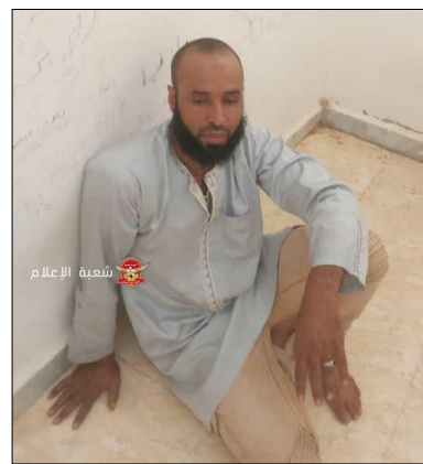
Weapons cache and the detainee