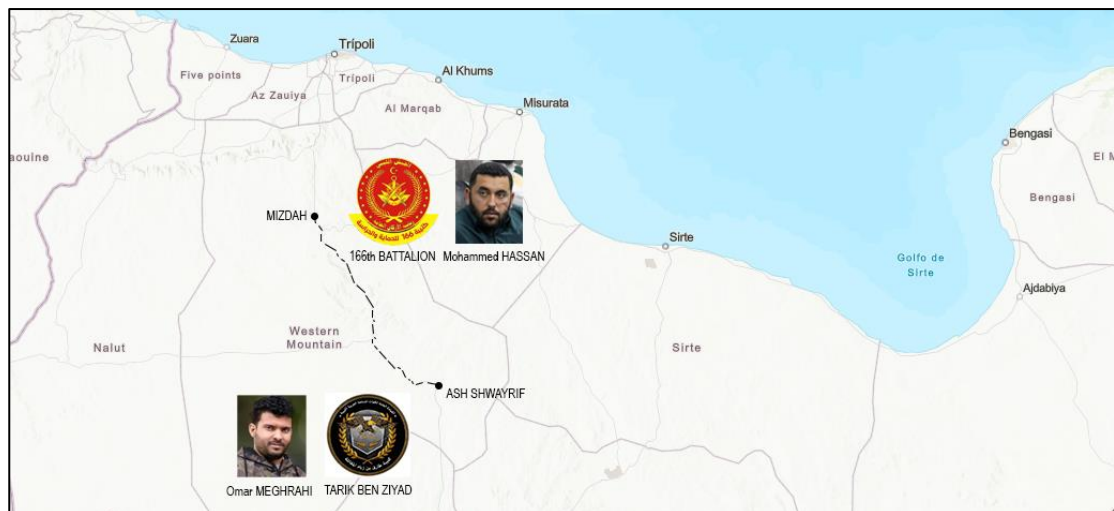
Coordination meeting to establish joint patrols along the Mizdah- Ash Shwayrif road

On 22 August, Abdulhamid Dabaiba commissioned Mohammed al Hassan's 166 th Battalion to secure and protect the water supply 1 (pipelines, reservoirs and pumping stations from the Great Man-Made River system) in order to prevent any hostile actions.