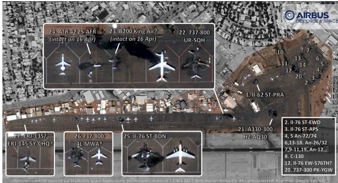
Photo: Destroyed aircraft as of Apr 21