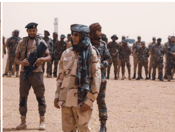
Photos -LNA Units form up under Major General Mabrouk