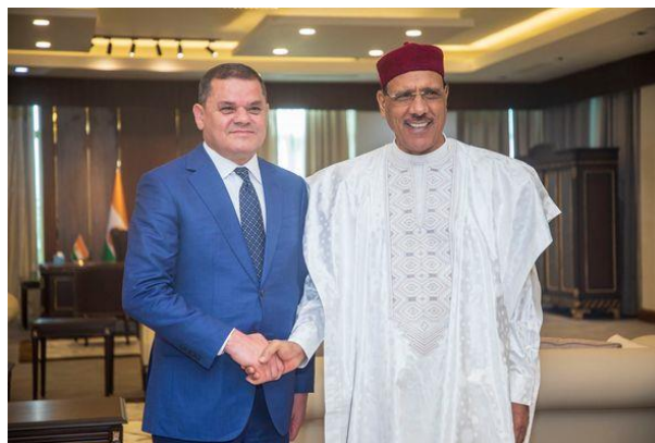
Image: Prime Minister (GNU) Dbeibah and President of Niger, Mohamed Bazoum

The prime minister stated that the two countries would work together to achieve business and development projects as stated that they had the "will to confront terrorism and migration." He stated that the Islamic Bank would support economic projects related to trade and the private sector and that the Free Zone in Misrata had plans to allow companies to invest.