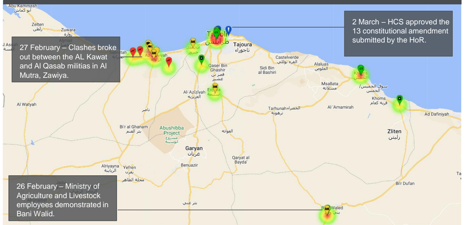
FIGURE 2: HIGHLIGHTED INCIDENTS IN TRIPOLI FROM 25 FEBRUARY – 3 MARCH 2023