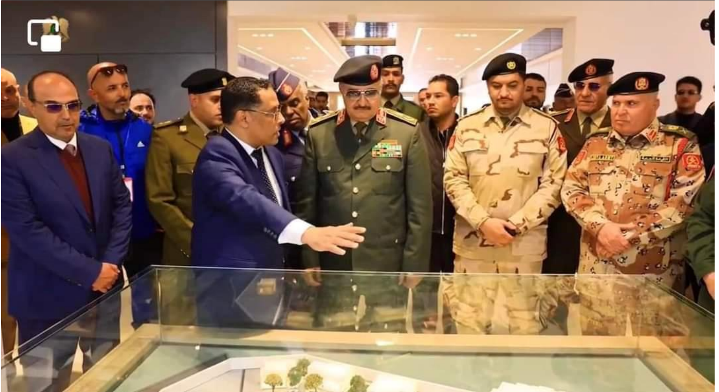
FIGURE 4: HAFTAR DURING 15 OCTOBER HOSPITAL INAUGURATION IN BENGHAZI, 2 MARCH 2023