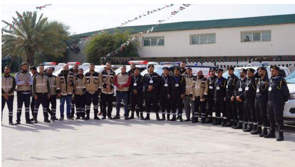
Image: Medical convoy in Tripoli prior to departure for Marj