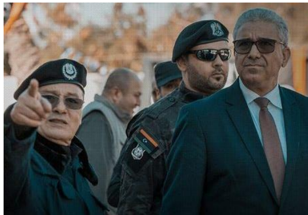
Image: Prime Minister (GNS) Bashagha touring the Bohdema area

Prime Minister (GNS) Fathi Bashagha and Minister of the Interior (GNS) Essam Bouzriba toured the Bohdema and Wahieshi areas of Benghazi after security operations targeting drug and alcohol dealers in the area. Of note, one report gave credit to the men, from Misrata and Zawiyah respectively, for purging the area of criminal activity within 48 hours after "years of incompetence and failure of the security services." Other reports have credited Deputy Minister of the Interior, Faraj Qaim, with the operations.