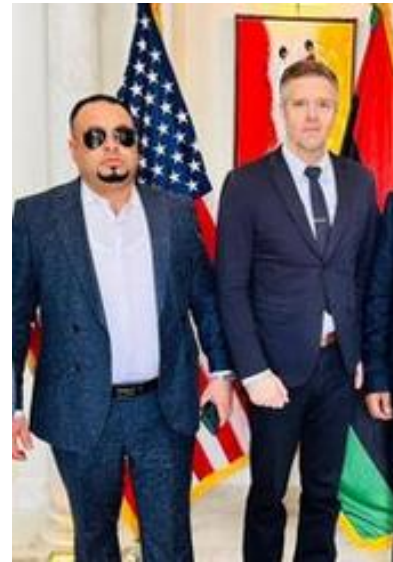
Fig. 2. Al-Dhawi with Ordeman, Jan 2023

Al-Dhawi is a rising star on the block. From a local criminal warlord to a leading position at the top of power in Libya. This shows not only national interest but also international interest. The same US Chargé D'affaires, Leslie Ordeman, met with Al-Dhawi in January 2023, alongside the Mayor of Zahra, Naser Abugdera, in Tunis, discussing, according to the 55th Infantry Battalion, issues of common interest. Ordeman was praising Al-Dhawi's efforts towards social and security stability within the Jafara District. The meeting with Al-Dhawi seemingly came as part of US efforts to ensure strategic objectives through engagement with 'relevant and capable actors in Libya'. It reasserts Al-Dhawi's role as an important, on-the-ground security actor, as well as an indication of the geographic importance of the Jafara District, part of the Tripoli cordon (Tawq Al-Asimah) and the Western Coastal Region.